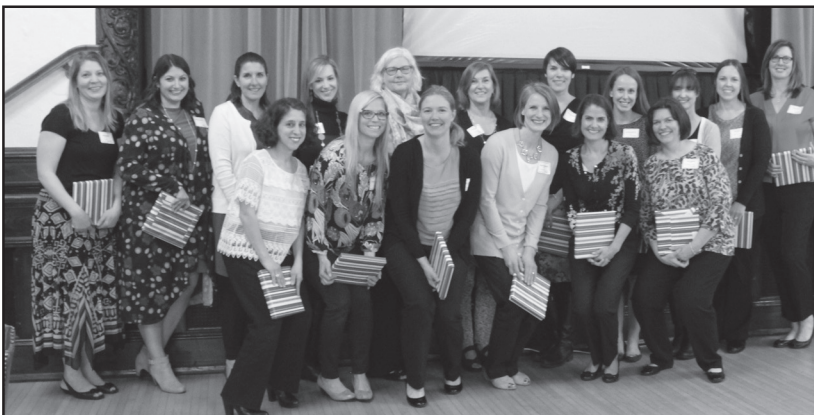
D39 15 year honorees

On May 10th, District 39 staff past and present gathered for Reflections, the annual event that honors retiring staff members and those reaching significant career milestones. There were five staff members retiring and each was highlighted in a video and given a personal send-off by their administrator. In addition, there were 26 employees celebrating five years of service, 22 completing 15 years, and five people marking 25 years with District 39.