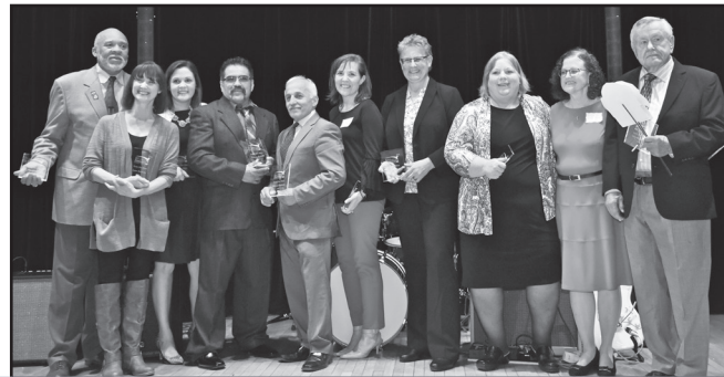
10 Every Day Heroes