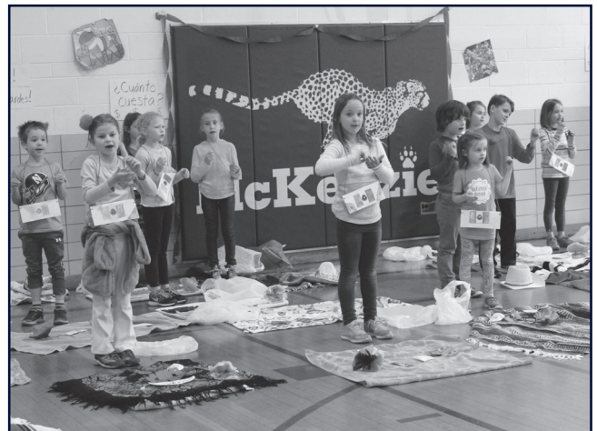
McKenzie 1st graders at the annual Mexican Mercado