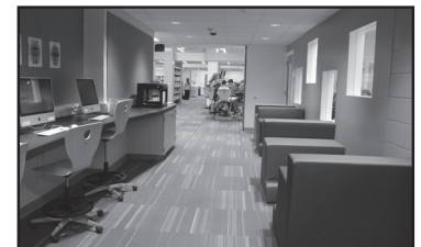
Learning Commons at WJHS (top) and Harper (left) opened at the start of the 2016-17 school year.